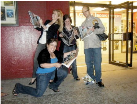
One of the teams at our Scavenger Hunt Social (June '10)