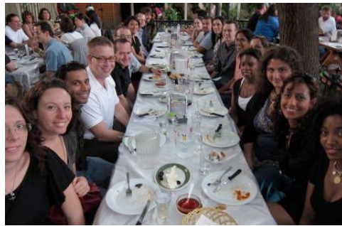
A Dinner in the Garden Fundraiser (Aug '10)

To everyone who joined us at the Dinner in the Garden fundraiser in support of the restoration of St. Michael's Cathedral on August 28, 2010 at Bairrada Churrasqueria.