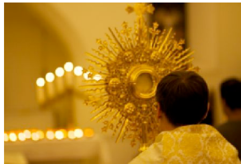
Prayer Gathering (Feb '10)

"You have been told, O man, what is good, and what the Lord requires of you: Only to do right and to love goodness, and to walk humbly with your God."