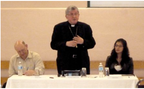
Faith Formation Meeting (June '10)