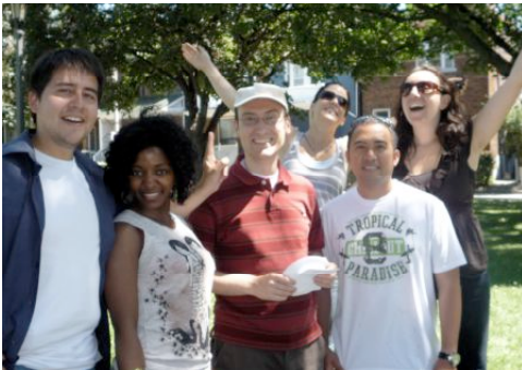
Coordinators' Picnic (July '10)